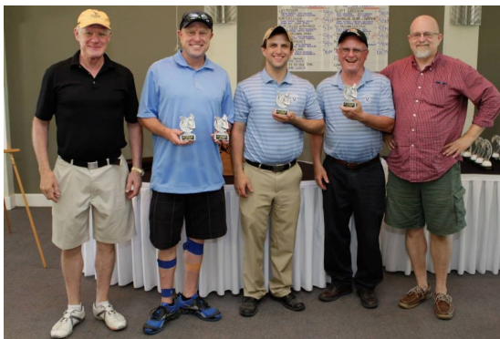
3rd Place Team - Hunters Glen Fellowship