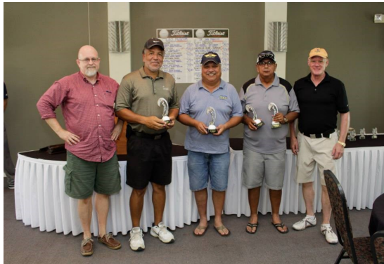
1st Place Team - Linebarger Goggan Blair & Sampson, LLP