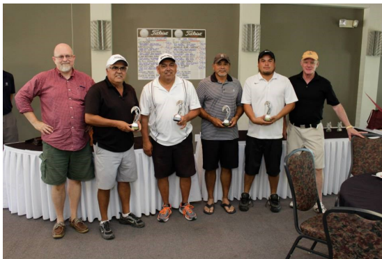
2nd Place Team - Carbajal & Associates