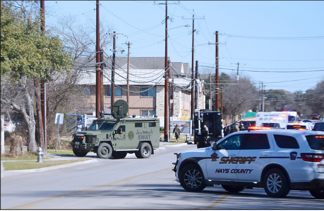
Above, SWAT units responded to a San Marcos apartment on Saturday, where the San Marcos Police Department later arrested a man on an aggravated assault with a deadly weapon - family violence charge.